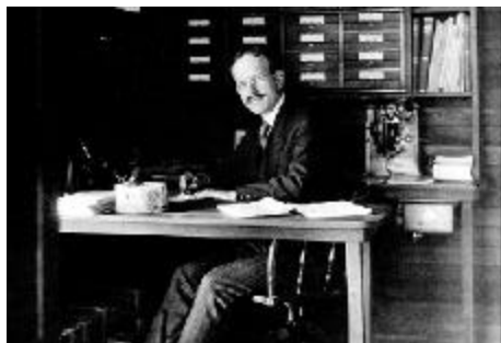
5) "Wilson and Palomar owe him a lot".

The orbital elements on IAUC 6303 indicate that the comet will pass only 0.11 AU from the earth on Mar. 26 on its way to perihelion rather more than a month later. The comet can be expected to become a naked-eye object, both on account of the approach to the earth, and later as it approaches perihelion. The predicted magnitude in the following ephemeris for around those times is, of course, highly uncertain. There is also a very large positional uncertainty, particularly in late March, when it amounts to tens of degrees.