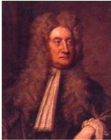
8) "Apple or Fig"

Io, Keeper of the Flame Jupiter Co-ordinator